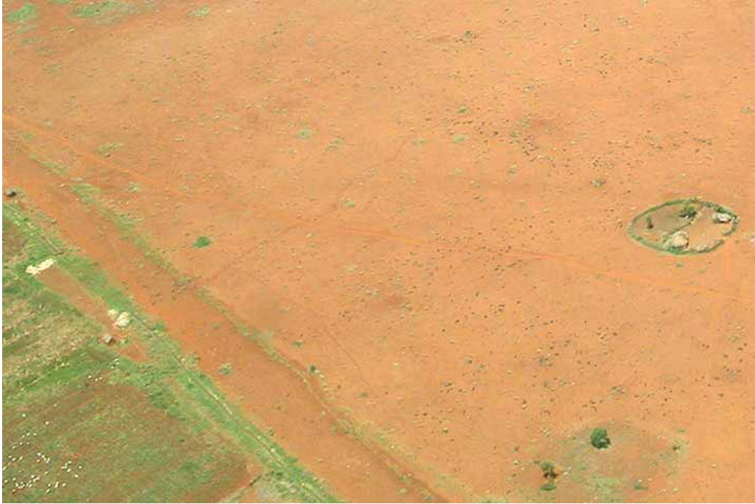
Photograph 2. Maasai boma (homestead) on the right with cultivated fields on the left, near Kimana in Kenya.