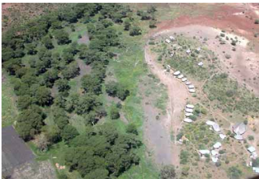
Photograph 4. Private Tourist Lodges near Kimana in Kenya.

The degree of conflict over access to resources that arose during and after the colonial period, particularly in the 1970s and 1980s, has not abated (Campbell et al. 2002; Noe 2003). The wildlife corridors have become foci of conflict between farming, herding, and wildlife-related land use systems. Tourism associated with wildlife viewing has become, however, an income source for some Maasai in the area in Kenya, and a few private wildlife viewing lodges and ranches have been developed (Photograph 4).