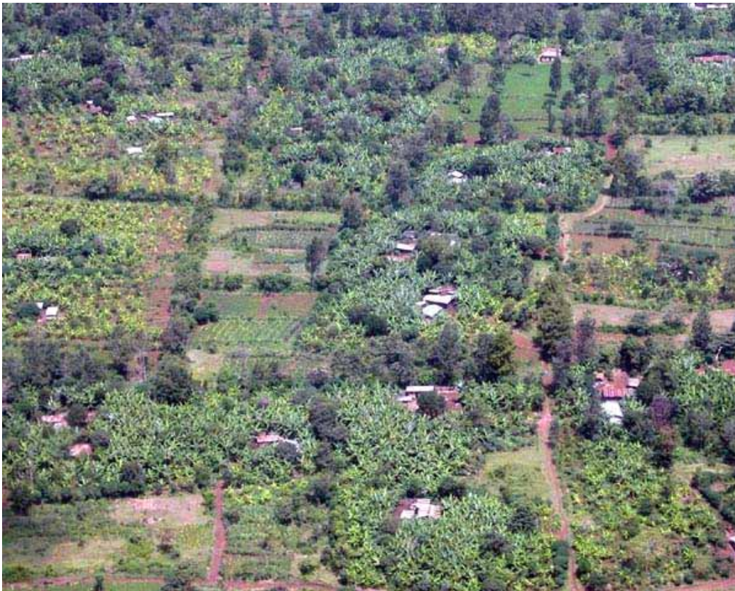
Photograph 3. Chaaga farms on the eastern slopes of Mt. Kilimanjaro in Tanzania.