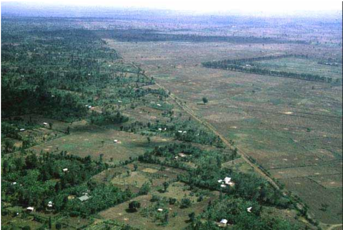
Photograph 1. The Tanzania (on left) and Kenya (on right) border on the N.E. slopes of Mt. Kilimanjaro.

One of the remarkable contemporary features of the landscape on the slopes of Mt. Kilimanjaro is the sharp land use-land cover boundary that cuts across the gradient coinciding with the political boundary between Tanzania and Kenya (Photograph 1). The general similarities in ecological conditions and potential land use on both the Kenyan and Tanzanian sides of the boundary raise the question as to why the contrast in land use-cover is so marked?